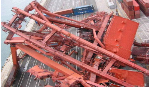
PICTURE: WINDSTORM DAMAGE