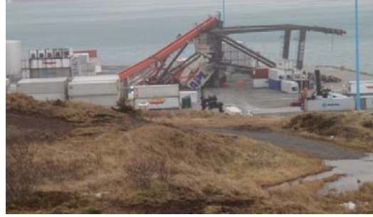
PICTURE: WINDSTORM DAMAGE